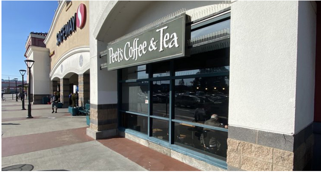
PEET'S COFFEE AND TEA