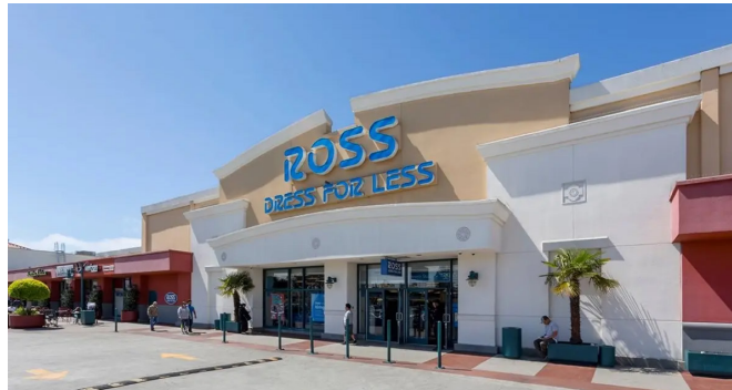
ROSS DRESS FOR LESS