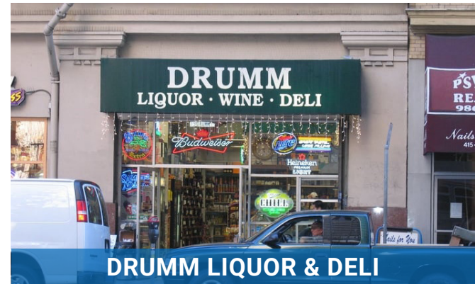
DRUMM LIQUOR & DELI