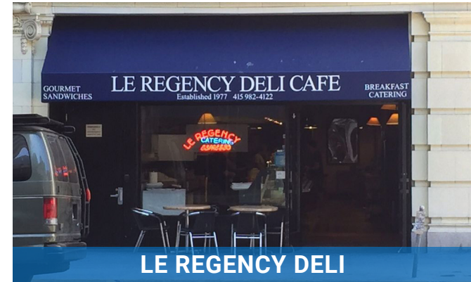
LE REGENCY DELI