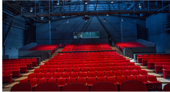
ROSS DRESS FOR LESS