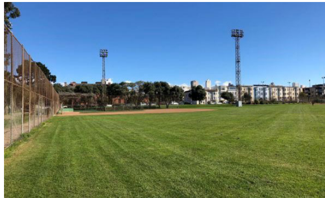
MOSCONE SOFTBALL FIELDS