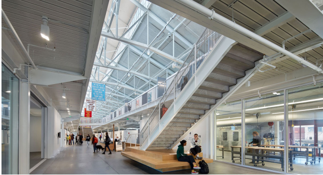
SAN FRANCISCO ART INSTITUTE