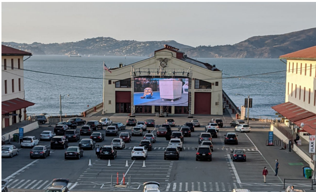
FORT MASON FLIX