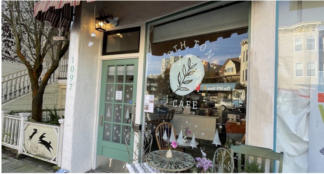
EARTH TONE CAFE