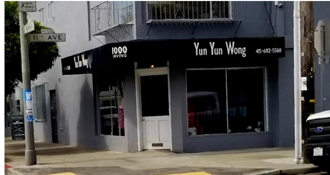
YUN YUN WONG