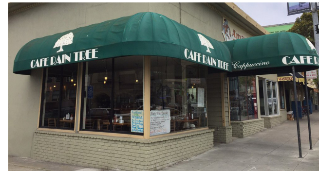
CAFE RAIN TREE