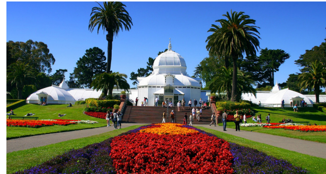
GOLDEN GATE PARK