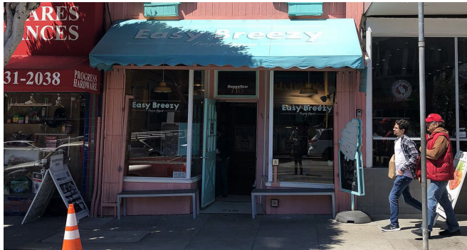
EASY BREEZY FROZEN YOGURT