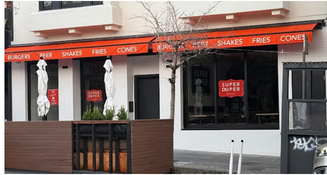
SUPER DUPER BURGERS