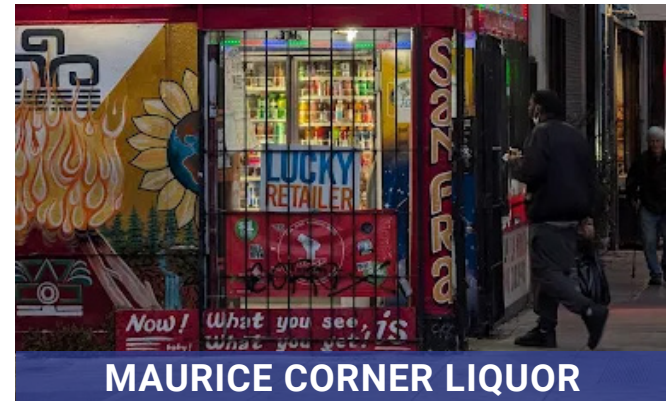
MAURICE CORNER LIQUOR