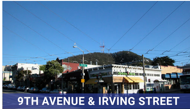
9TH AVENUE & IRVING STREET