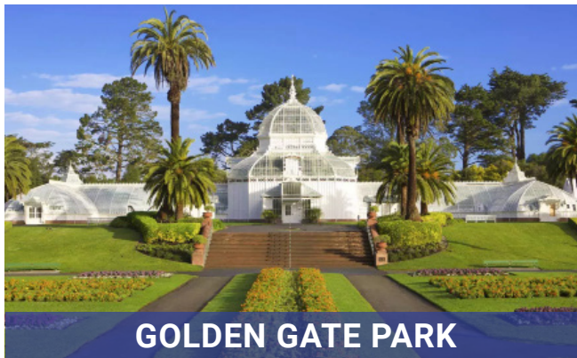
GOLDEN GATE PARK