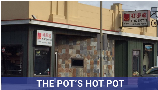
THE POT'S HOT POT