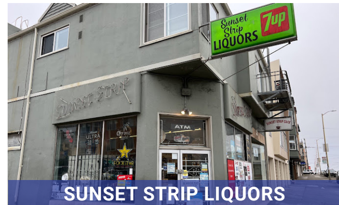
SUNSET STRIP LIQUORS