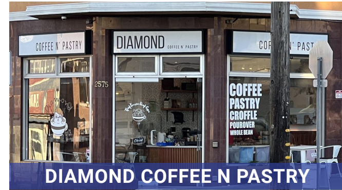
DIAMOND COFFEE N PASTRY