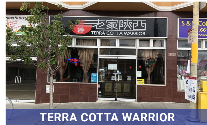
TERRA COTTA WARRIOR