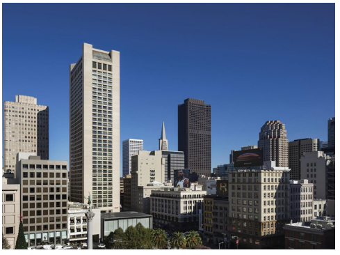
GRAND HYATT HOTEL