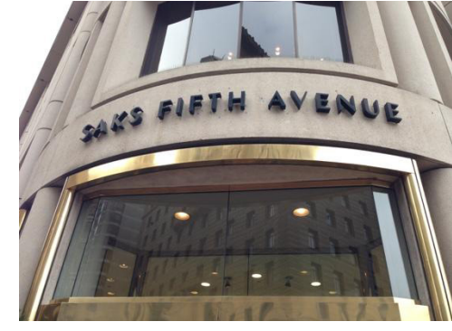
SAKS FIFTH AVENUE