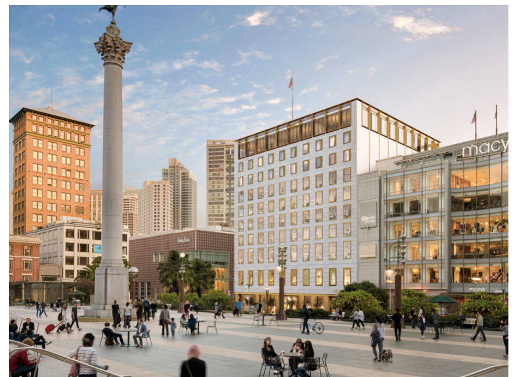
UNION SQUARE | THE VIBRANT HEART OF SAN FRANCISCO

Grand Hyatt Hotel, Marriot Hotel, Saks Fifth Avenue, Apple and many well-known tenants are all situated nearby.