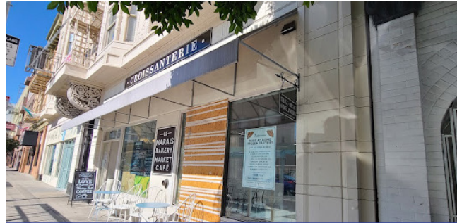
LE MARAIS BAKERY