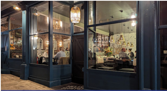
DACHA KITCHEN & BAR