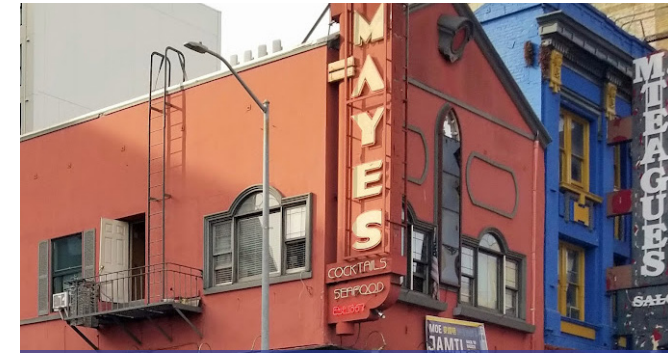
MAYES OYSTER HOUSE