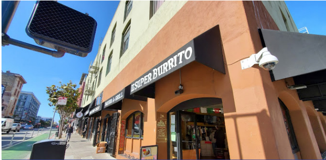
EL SUPER BURRITO