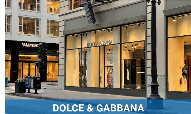
DOLCE & GABBANA