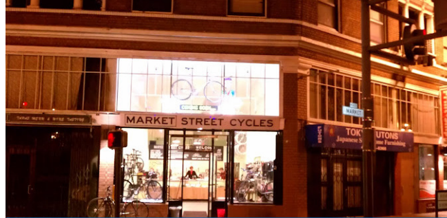
MARKET STREET CYCLES