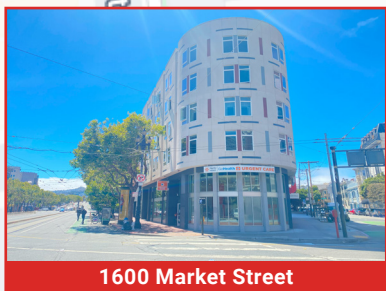
1600 Market Street