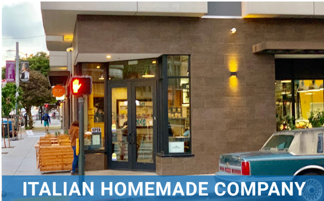
ITALIAN HOMEMADE COMPANY