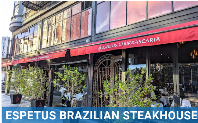
ESPETUS BRAZILIAN STEAKHOUSE