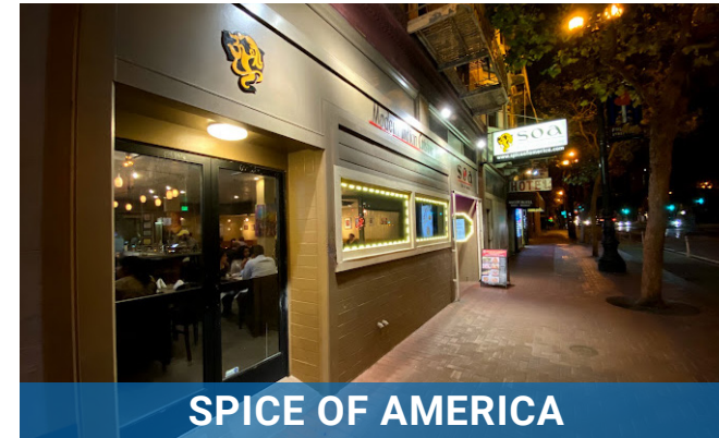
SPICE OF AMERICA