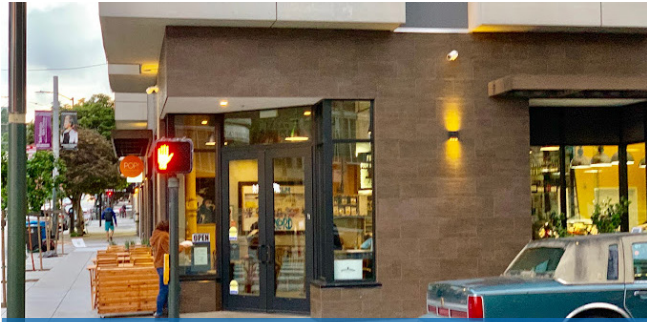
ITALIAN HOMEMADE COMPANY