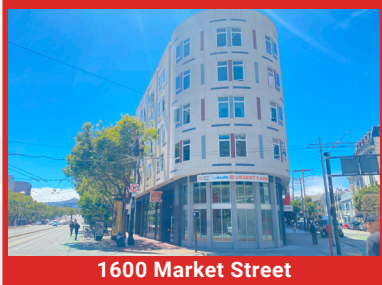
1600 Market Street