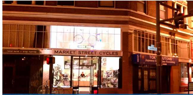
MARKET STREET CYCLES