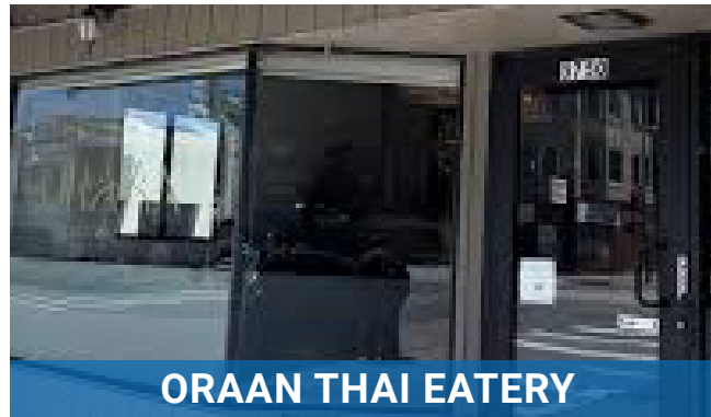
ORAAAN THAI EATERY