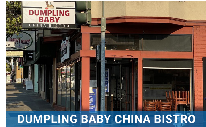
DUMPLING BABY CHINA BISTRO