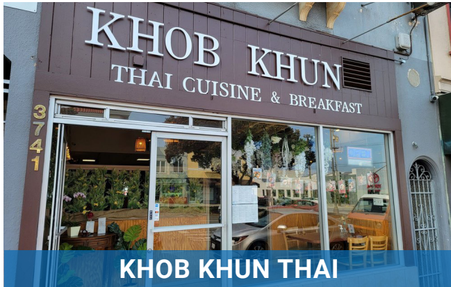
KHOB KHUN THAI