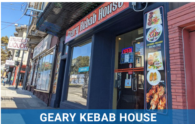
GEARY KEBAB HOUSE