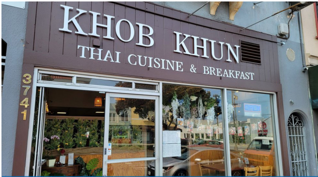
KHOB KHUN THAI