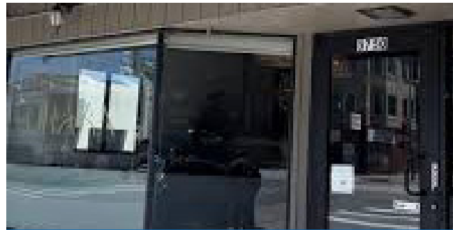
ORAAAN THAI EATERY