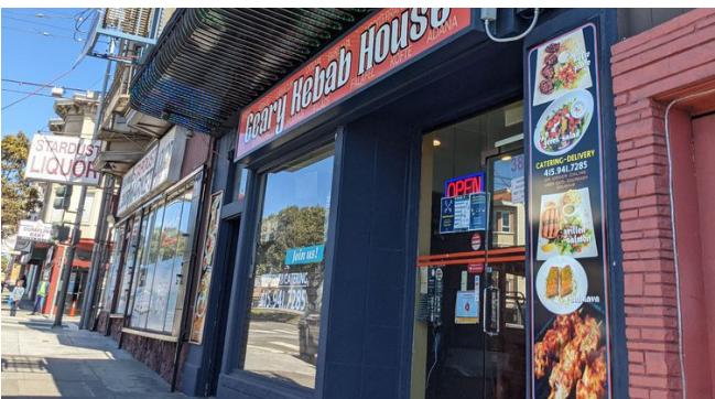
GEARY KEBAB HOUSE