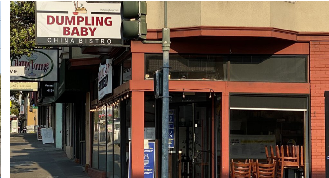
DUMPLING BABY CHINA BISTRO