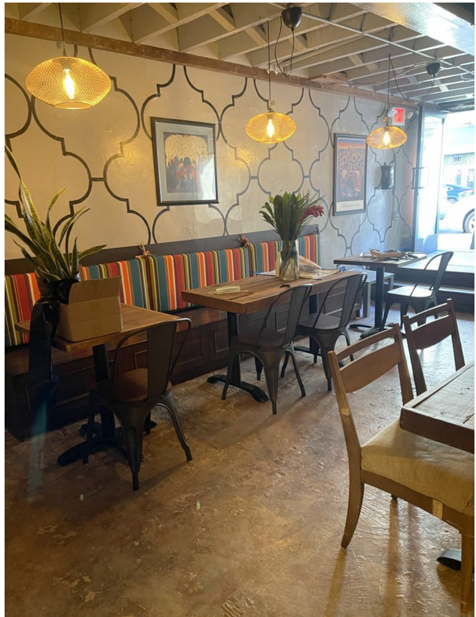
*Photo is not current taken and does not represent the current condition of the space.

Don't Miss Out on this Superb Opportunity!