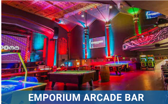
EMPORIUM ARCADE BAR