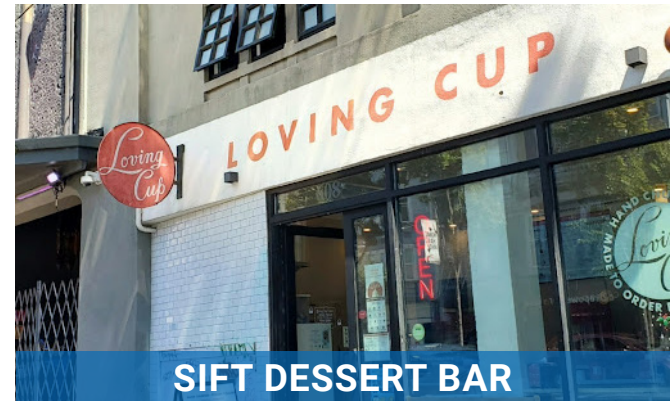
SIFT DESSERT BAR