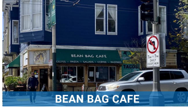
BEAN BAG CAFE