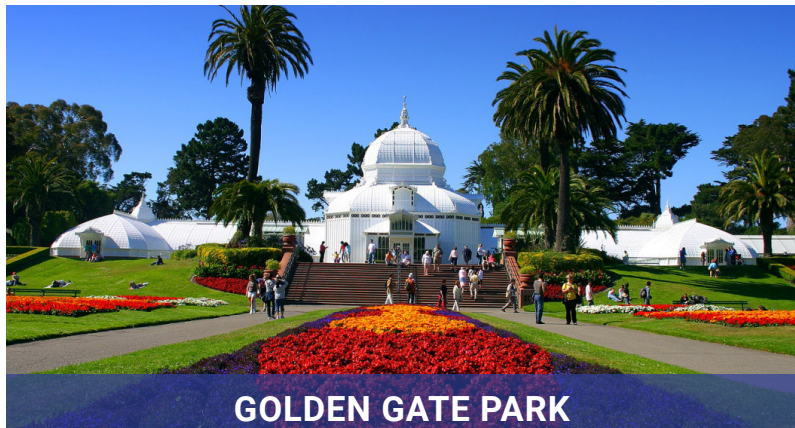
GOLDEN GATE PARK