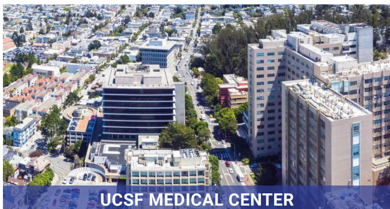
UCSF MEDICAL CENTER