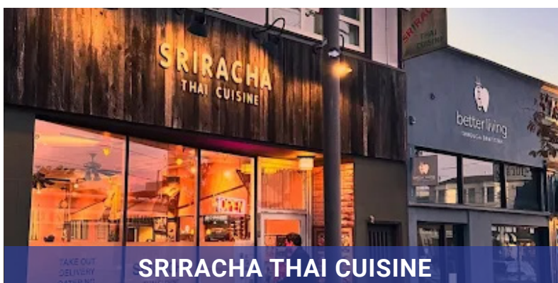
SRIRACHA THAI CUISINE